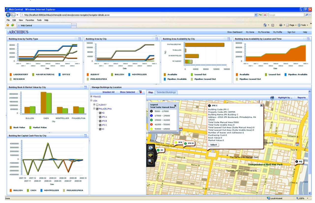
Example: Personalized dashboard view of real estate portfolio holdings and performance

The same holds true for leasing information. Standard KPIs relating to leasing for this particular banking institution include the number of leases terminating within 180 days, number of lease options to be "decisioned" within 180 days, total annual base rent by business unit, and total rentable square footage leased by business unit.