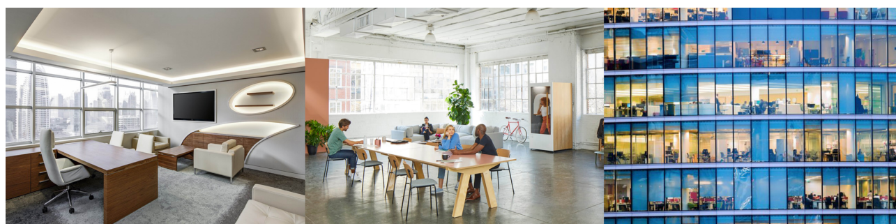
Figure 2: Examples of flexible workspace modes

Many flexible workspace facilities offer hybrids of two or more of these modes. The degree to which the traditional letting and corporate spaces are self-contained varies between sites and operators. For each of these modes, there is usually the opportunity to add on shared or exclusive meeting, common and sometimes recreational facilities and services where not already part of the letting arrangement. Coworking spaces may also be part of a membership scheme (detailed further in the next section).