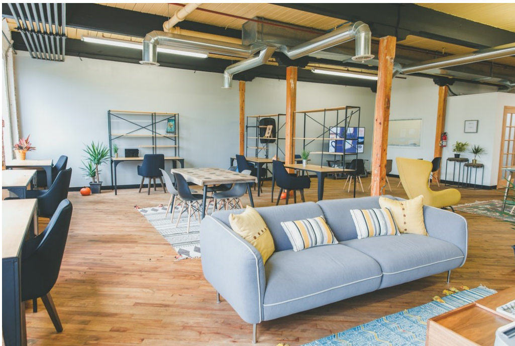
Figure 3: A heavily fitted-out flexible workspace

Within each ownership structure there may be agreements between the landlord, lessees and management companies regarding who is responsible for the funding, design and installation of the fit-out and furnishings, as well as who is responsible for repairs and other constituent parts of a lease or licensing arrangement for real estate. In a market where price and take-up can be heavily reliant on aesthetics and quality, fit-outs can be expensive and onerous. In some cases, the party investing in the fit-out may take some time to realise a positive investment, and this then affects the nature of any valuation and the way in which it is viewed by the corresponding parties involved.